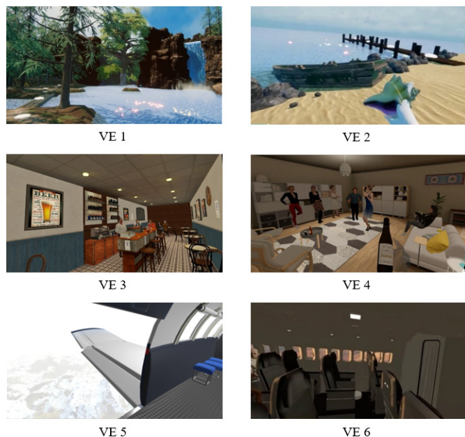
Figure 1 Virtual environments presented: forest (VE 1), beach (VE 2), bar (VE 3), party (VE 4), parachute jump (VE 5), plane (VE 6).

a therapist specialising in therapeutic relaxation and can be found in online supplemental file 1. These instructions take into account the VE presented and guide the participant through the scenario.