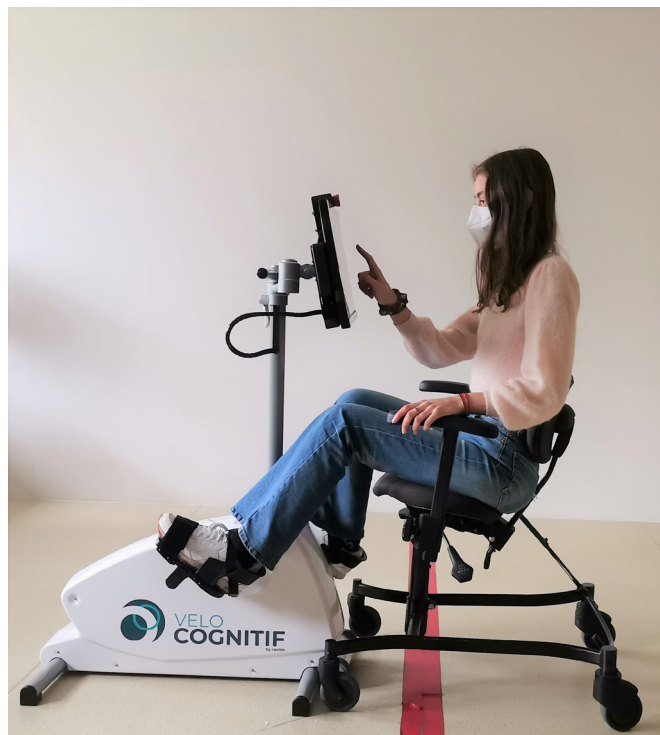
Figure 3 Vélo-cognitif (cognitive bike) consisting of an exercise bike to which a digital touch pad is attached to allow cognitive exercises to be performed while pedalling. The authors (including the person pictured in the figure) declare that this photograph was illustrated by one of the coauthors, and grant permission and give their consent to BMJ open for the use of this photograph for publication, including print or web-based publications. The authors understand that with their authorisation the photograph can never be revoked.

to practise a cognitive and physical dual task. This tool combines an exercise bike and a touch pad offering cognitive training games. The bike has different levels of resistance. The cognitive exercises are designed by HappyNeuron, a network of scientific experts specialising in cognitive training. These exercises include training in inhibition, attention, memory and visuo-spatial skills through playful games of various difficulty levels. By simultaneously stimulating motor skills and cognition, this tool offers a playful activity in which the participants are able to see themselves progressing and which could reduce